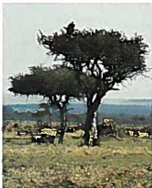
grass with trees